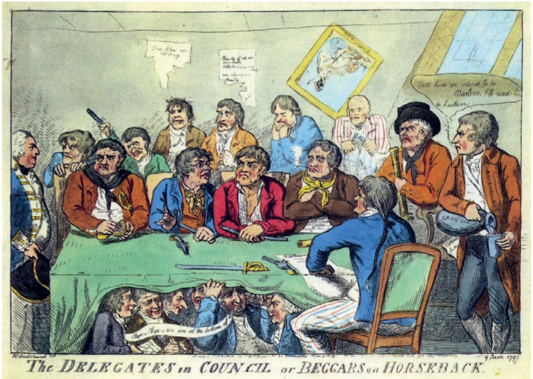
The Delegates in Council, or beggars on horseback , cartoon of the delegation of sailors who devised the terms of settlement of the Mutiny of Spithead, 1797.

In the event, the declaration of war was not followed by fleet engagements in 1793, in part because the French fleet was unprepared, while the policy of open, rather than close, blockade limited British opportunities for combat. At any rate, the leadership and administration of the French fleet was badly affected by the collapse of royal authority in the French Revolution and the resulting political and administrative disruption. Aside from a breakdown in relations between officers and men, there was factionalism within the officer corps and the contrary demands of politicians in Paris and the ports. Disaffection within the French navy proved more serious than its British counterpart during the naval mutinies of 1797. In 1793, the British were invited into Toulon by French Royalists, before being driven out again by Revolutionary forces benefiting from the well-sited cannon of Napoleon, then a young artillery officer. France lost 13 ships of the line as a result