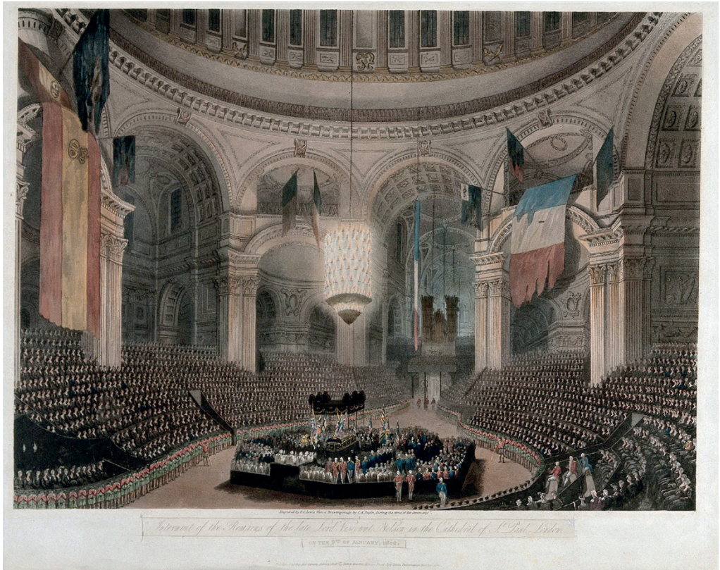
Augustus Pugin (1762-1832), Arrival of Admiral Lord Nelson's funeral carriage for interment at St. Paul's Cathedral, London. Ensigns captured from the Spanish and French fleet during the Battle of Trafalgar hang from the galleries.

still in control of the Dutch fleet and continuing an active programme of naval construction. Naval officers were divided over the peace, a division that reached to the naval MPs in the House of Commons, with George Berkeley joining attacks on the Addington ministry and its Admiralty. A resumption of war seemed very likely, and the navy readied itself accordingly.