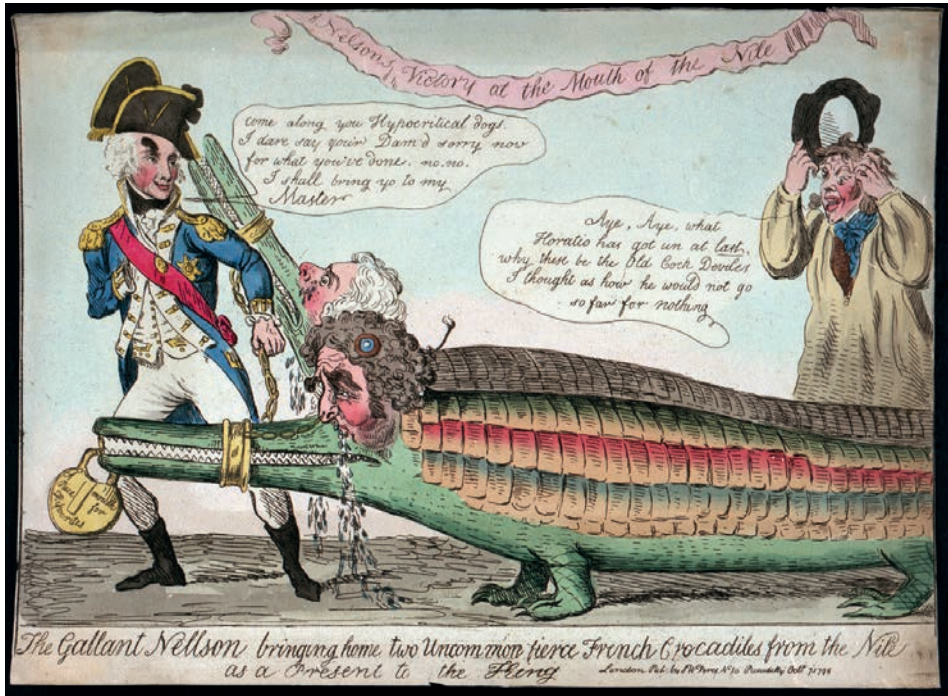
Isaac Cruikshank, The Gallant Nelson bringing home two Uncommon fierce French Crocodiles from the Nile as a Present to the King (Samuel William Fores, 7 October 1798). This satirical print is mocking British politicians Charles Fox and Richard Sheridan who celebrated Nelson's victory at the Battle of the Nile despite being, at least in part, pro-republican. National Maritime Museum (PAD 4102).

fety of Minorca handicapped the subsequent British pursuit in the Mediterranean, and the French were able to sail to Toulon, relieve Savona, and eventually return to Brest, without being intercepted. They returned with 15 Spanish of the line, ensuring that Brest posed a major challenge and that its blockade had to be strengthened.